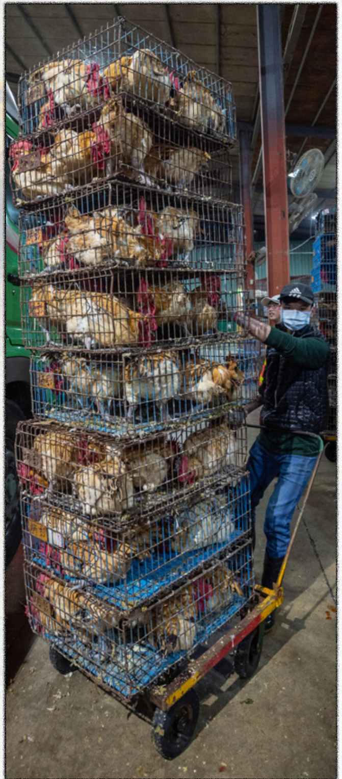
Chickens being unloaded from trucks at a slaughterhouse, 2019.

We must act now to save lives in the future and prevent the next global pandemic.