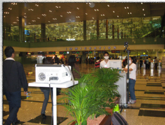
Arrivals at Singapore airport being scanned for fever in response to swine flu, 2009.

Although there is a conflicting and admittedly 'sketchy' claim that the swine flu pandemic arose in Asia with no mention of the role of domesticated pigs, 42 possibly as an attempt to absolve North American farming, the first human case of Pandemic H1N1/09 was recorded in Mexico in early 2009.