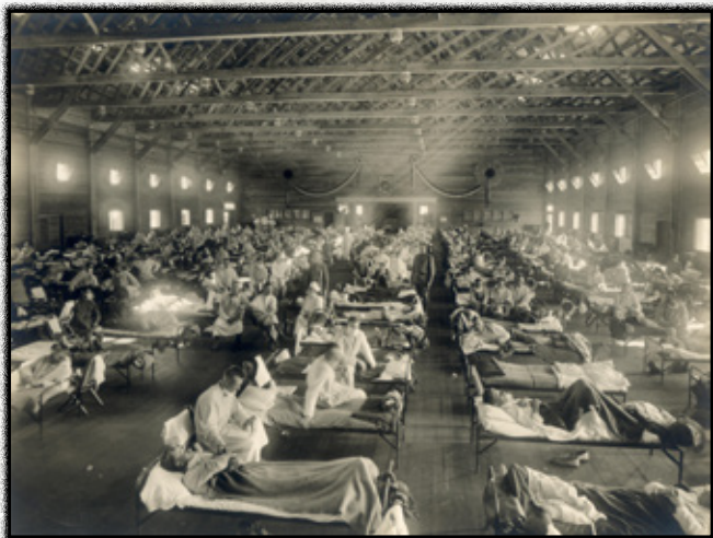
Emergency hospital during influenza epidemic, Kansas c.1918