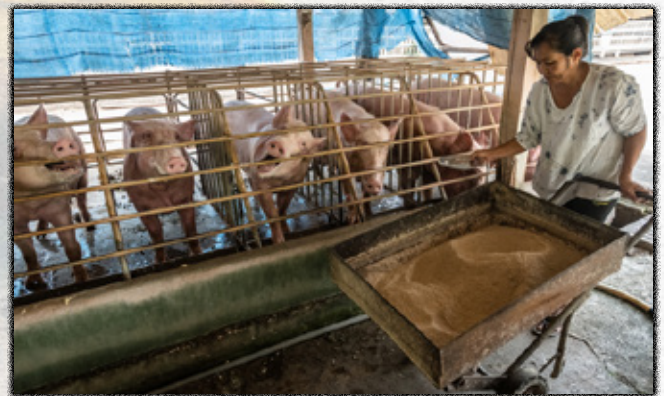
The Malaysian Nipah outbreak in 1998 spread from fruit bats to pigs and then to humans. The epidemic was finally stopped by mass culling of pigs.

infected bats came into contact with piggeries; and in Australia, it is believed bats with Hendra transmitted the virus to horses via saliva from chewed up fruit that was dropped down onto grass where the horses grazed. Hendra has claimed the lives of handlers and owners of horses.