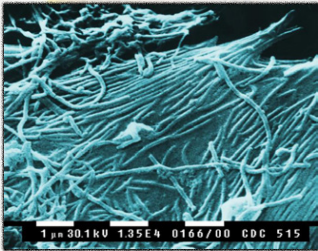
Scanning electron microscopic image of Ebola virions. Creative Commons

Ebola Virus Disease (EBV) is a viral hemorrhagic fever that is in fact caused by four viruses of the genus Ebolavirus , but the most dangerous is simply called Ebola virus (EBOV). The virus's natural reservoir - that is the animal or animals in which it survives and thrives in nature, usually without causing any harm - is thought to be several species of fruit bats. Monkeys, chimpanzees, gorillas, baboons, dogs and pigs may all be susceptible to EBOV infection.