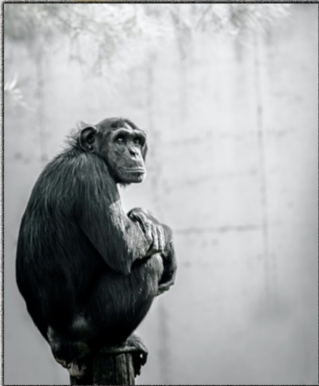
HIV is thought to have crossed over to humans from the killing and butchering of chimpanzees and monkeys infected with SIV.

particularly when butchering the animals. 25 It is not impossible that someone could have inadvertently exposed a cut or wound to infected animal fluids by some freak occurrence, leading to the genesis of HIV from SIV, but it is not unreasonable to postulate that the conditions leading up to the start of the HIV epidemic and pandemic would have been less lightly to occur without hunting and butchering - not just the actual transmission of the zoonoses, but the increased human factors resulting in an outbreak of sufficient magnitude to one day result in a global pandemic that has claimed many millions of lives.